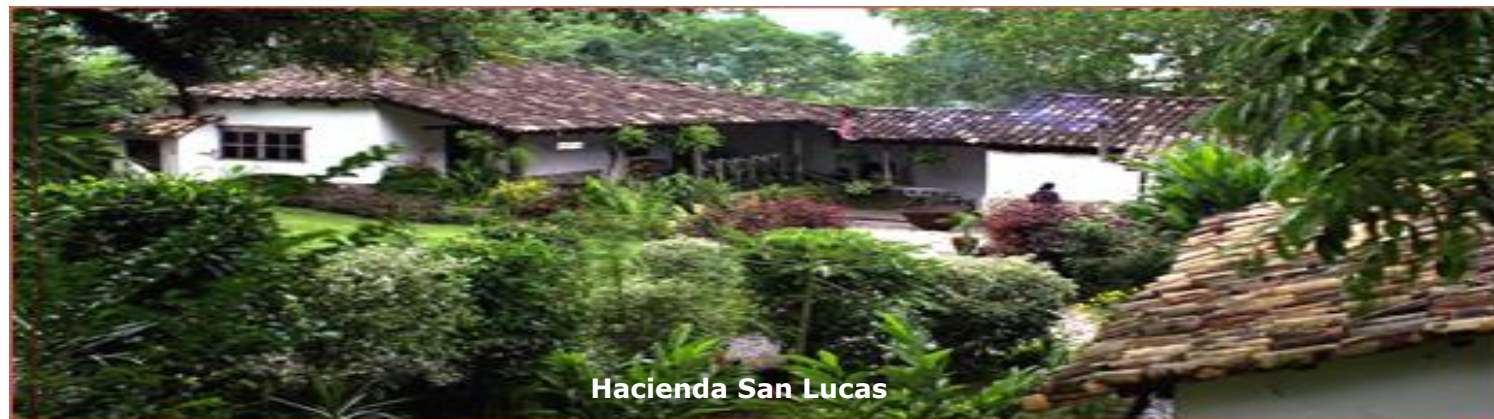
Hacienda San Lucas

Day 8: Transportation to Airport for Departures! Hasta Luego y vaya con Dios!