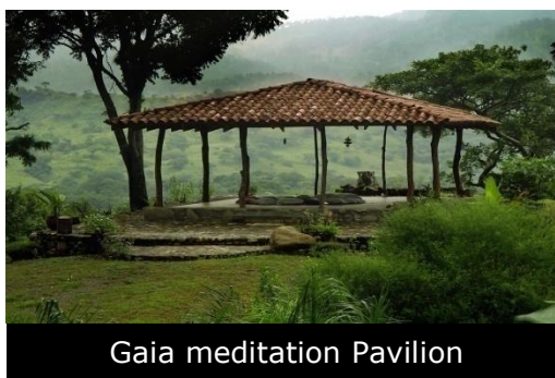
Gaia meditation Pavilion

Day 2: After breakfast, we will gather at GAIA, with panoramic views of the entire Copan Valley for a blessing way ceremony, to ask for safe passage from the spirit guardians of the land. Then, off for a hike to a mysterious pre-Columbian site of ancient carved rocks, which the locals call Los Sapos (the toads, or frogs). Rock carvings of crocodiles, frogs and women giving birth; ancient pottery, and other relics found in this grove of living stones lend credence to the traditional belief that this was a sacred ceremonial site dedicated to fertility. In the afternoon, Mayan archaeologist David Sedat will present a private lecture on the mysteries of Copan and the latest discoveries at the ancient archaeological site. We enjoy another scrumptious dinner and story-telling under the star drenched skies of Northeastern Honduras. Dulces Suenos! ( Breakfast, 5-course dinner )